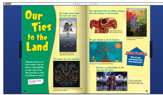
Digital Student Guide