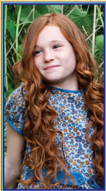
Lily before she starts school at Hogwarts

Harry Potter's parents, Lily and James, meet at Hogwarts School of Witchcraft and Wizardry when they are students. They fall in love and eventually get married.