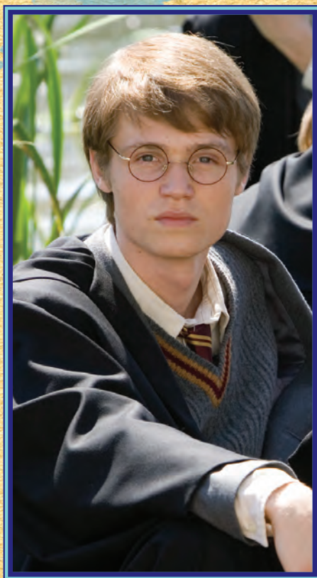
James as a Hogwarts student